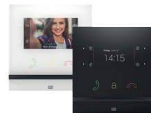
Black 91378501 White 91378501WH

Stylish and affordable video answering unit designed for the residential market