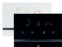
Black 91378401 White 91378401WH

Indoor audio unit with HD sound to receive calls from any IP intercom