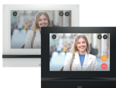
Black 91378601 White 91378601WH

Stylish and affordable video answering unit designed for the residential market