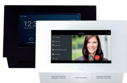
Black 91378376 (with wifi) White 91378376WH (with wifi) Black 91378375 White 91378375WH

Multifunctional Communicator with advanced integrations with home automation systems